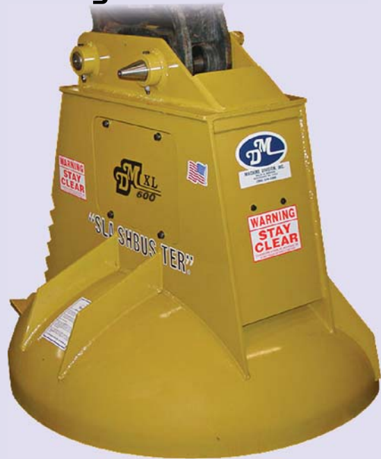
Standard blade bar

Note: It is recommended that the excavator is provided with a hinged front screen guard for the front of the cab that meets or exceeds SAE J1084 specs